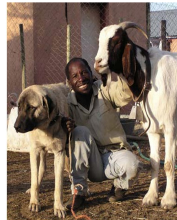
Livestock Guarding Dogs with their flocks and farmer